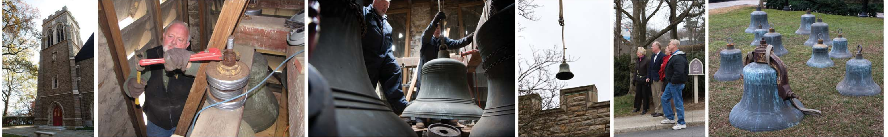
The bells of Christ Church were hoisted from the bell tower and packed for the journey to the Verdin factory. The bells will be polished and each one tuned to exacting pitches. New bell ringing equipment will be fabricated in the Verdin factory to ensure safe ringing of the bells ...

Through the generosity of church members, the bells of Christ Church (Episcopal), Greenwich, Connecticut were restored by The Verdin Company of Cincinnati, Ohio. Four new bells were added to the existing ten, creating a chime of bells. The bells, including a 900 lb. swinging bell, were restored and new bell ringing equipment fabricated in time for a November dedication service. All work was done by The Verdin Company, a fifth generation family owned bell company.