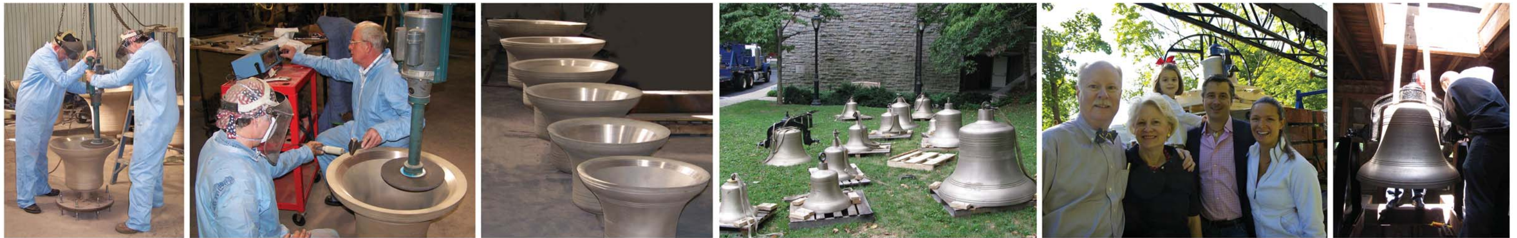
Tuning of the bells requires years of experience and a precise touch. Each bell is tuned to a specific pitch by shaving the bronze ...